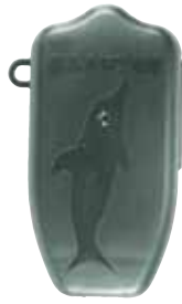
Optional protecting box